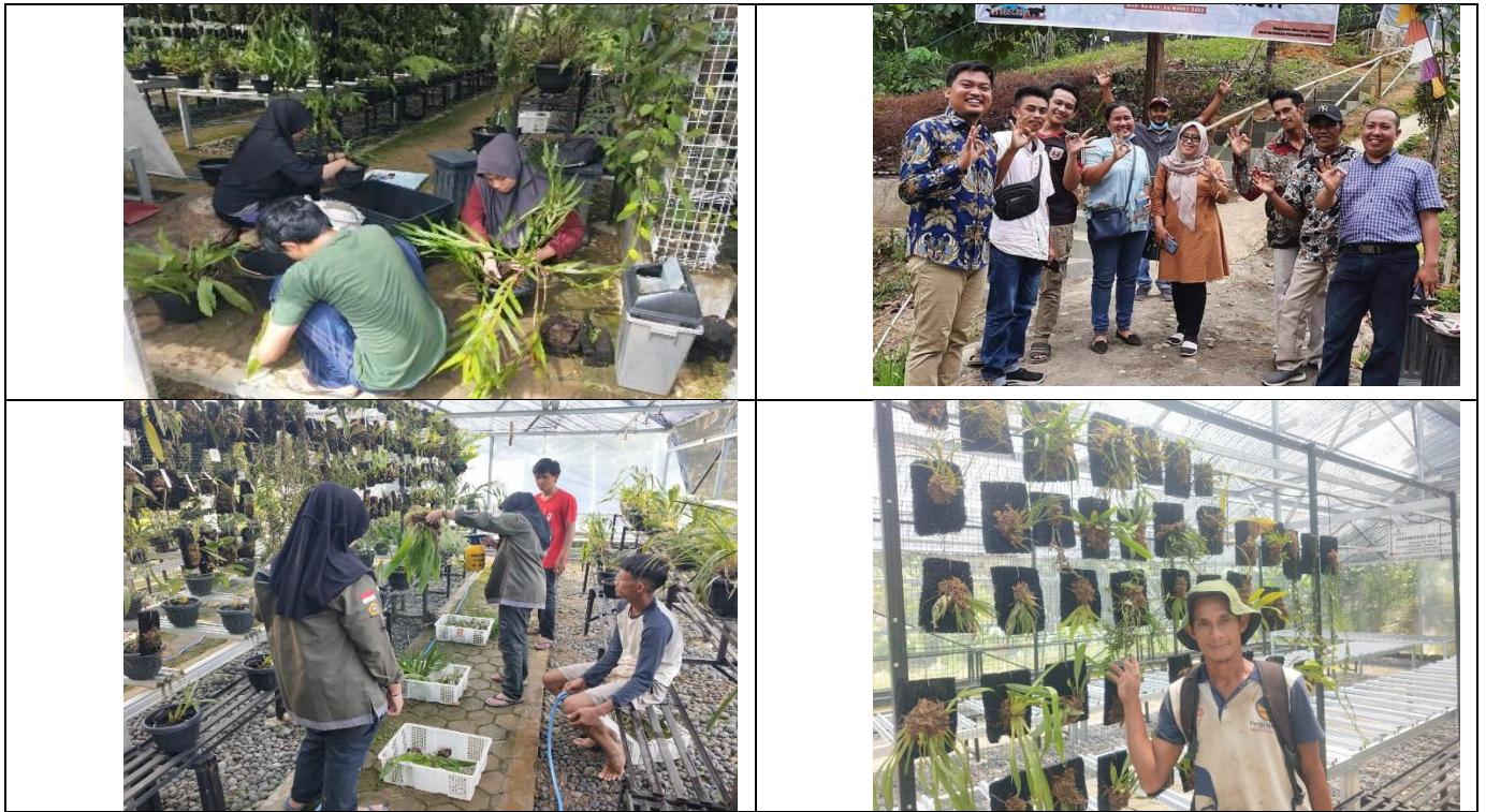
Figure 2. Social Activity