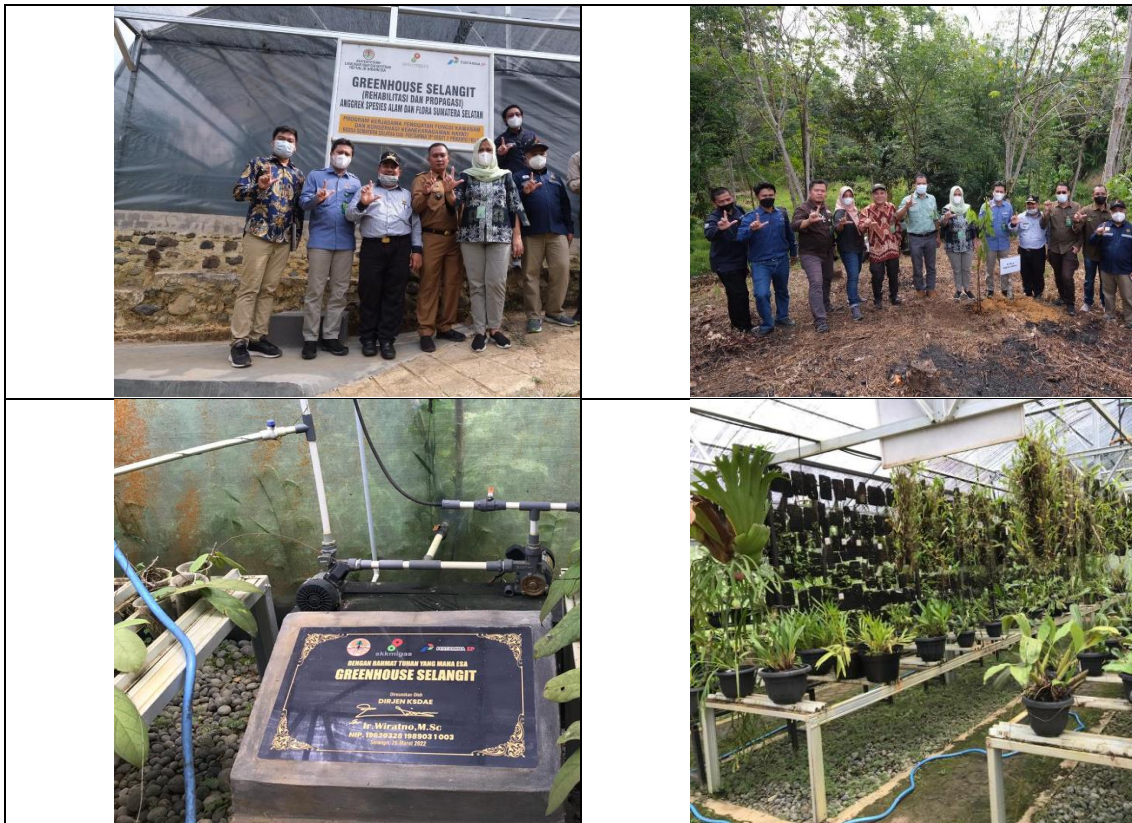
Figure 4. Visiting Activities