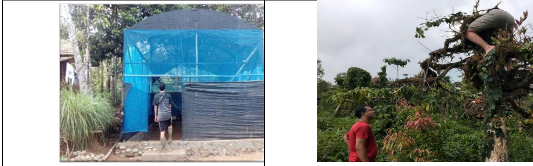
Figure 1. Orchid Plants Rescue Activities