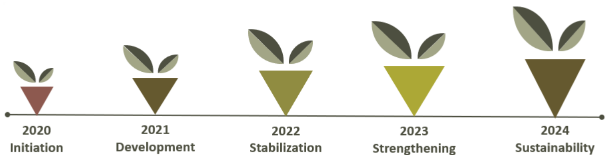
Figure 3. Program Sustainability