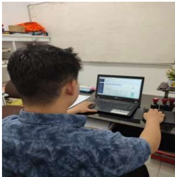
Figure 2 The process of using Inaportnet by PT. JSM agents