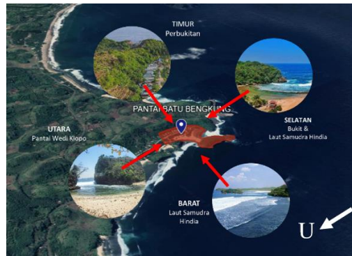
Figure 11 Picture of Batu Bengkung Beach tourist boundary

Based on observations made by observing the site directly, findings such as site boundaries, existing buildings or facilities, and activities and activities of the perpetrators were collected. The boundary of Batu Bengkung Beach is surrounded by hills and the Indian Ocean ocean. Explanation of tread boundaries in the following figure: