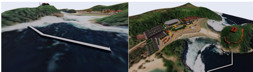
Figure 6 Break water images

Based on the results of the analysis conducted to respond to the tsunami disaster on Batu Bengkung beach tourism, the author designed a tour using Tetrapot to break waves from two directions because in the middle of the beach there is a stone cape that is used for tourist activities so that the cape has become a protector or natural breakwater but still needed a Tetrapot arrangement to break the waves so that tourists are safe in buildings that have been designed for Tsunami disaster response. The following is the application of break water in the following figure: