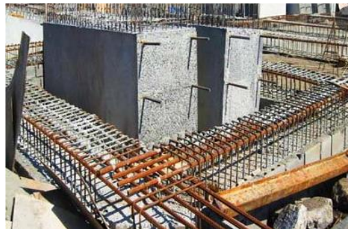
Figure 4 Pictures Reinforced concrete structures

In the building aspect, creating vertical evacuation is the answer to generating shelter. This principle has an adjustment to the criteria for tsunami response buildings. According to the United States Federal Disaster Management Agency (FEMA) mentioned several Structural Design Guidelines for Vertical Evacuation buildings from tsunamis. The first is to make buildings made of concrete. Actually, some experts and architects from Japan revealed that wood material is better because of its flexible nature. So it will be safer in the event of an earthquake. But this actually makes the building vulnerable in the event of a tsunami. FEMA suggests vertical buildings made of reinforced concrete or steel frames are recommended. These powerful vertical evacuation buildings create a protection area for humans when evacuation out of the tsunami impact zone is not possible. Concrete structure in the following figure: (Repadi et al., 2016)(Parisi, 2013)