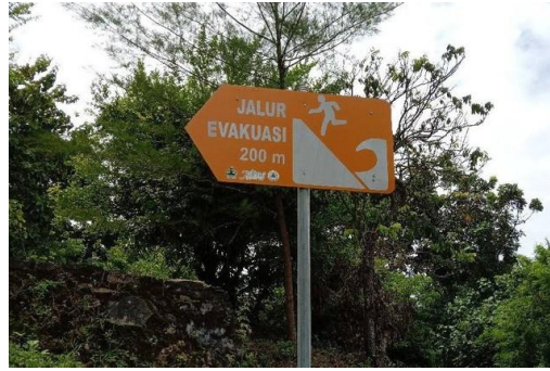
Figure 3 Image of Jatimalang evacuation route marker