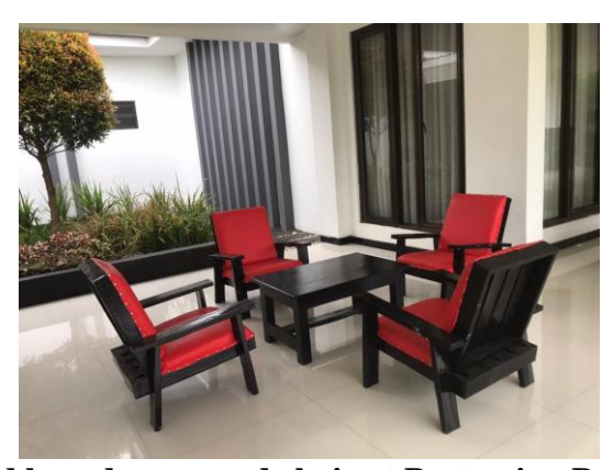
Figure 3: Recycled board processed chair at Pertamina Prabumulih General Manager Office House

The Independent and Sustainable Waste Recycling Center Program (PADU PADAN) is an educational activity on sorting and processing organic and inorganic waste into value-selling products. This program is under the auspices of CSR PT Pertamina EP Prabumulih Field located in South Sumatra.