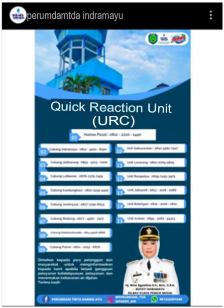
Figure 1. Rapid Reaction Unit TEAM Number

This aspect tests the responsiveness or response of employees to complaints from customers either directly or through digital platforms. With the development of the era of public services, Perumdam Tirta Darma Ayu has used a digital platform like the picture above and with the existence of public services that through digital platforms require public service employees to be responsive to complaint information from the public. Therefore, with the change of Perumdam leaders, Tirta Darma Ayu created a Task Force called URC (Rapid Reaction Unit) which serves customer complaints for 24 hours. However, in practice, there are still employees who are not responsive, always delay the processing of complaints, or even employees sometimes do not stand by their mobile phones when they receive a report that enters the Public Relations of the Head Office, which is what makes the service said to be not completely excellent. In addition, sometimes there is miscommunication when the Public Relations phone number of the head office changes, but the Service Branch and Service Unit still list the old Public Relations number