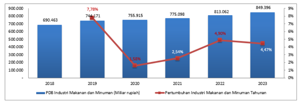
Figure 1 Food and Beverage Industry Growth Data Trends

Lifestyle changes in Indonesia's urban centers largely follow established market trends, with office workers having less time to cook, or less keen to do so, but demanding health-promoting foods. Importantly, shoppers gain access to a wider range of products thanks to the country's growing retail infrastructure, with hypermarkets and minimarkets moving deeper and spread across regions. Improving logistics facilitates the distribution of perishable goods, such as frozen food, throughout the archipelago. The food and beverage industry in Indonesia increased from 2020 to 2021 by 2.54 percent to Rp775.1 trillion, the Central Statistics Agency (BPS) reported the gross domestic product (GDP) of the national food and beverage industry on the basis of prevailing prices (ADHB) of Rp1.12 quadrillion in 2021. This value is 38.05 percent for the non-oil and gas processing industry or 6.61 percent for the national GDP which reaches Rp16.97 quadrillion (Sari, 2022).